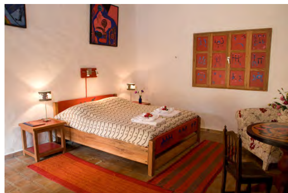
Left:: 2 of Ecuador's 123 species of hummingbirds © P. Arnold. Center: Spectacled bear. Right: right: one of the rooms

South America has more birds than anywhere else. Ecuador straddles the equator and Andes (20,000' peaks). Although it is only slightly larger than WY, Ecuador has 4 times as many bird species (>1,600). 10-day trip will introduce you to a biodiversity hotspot, instill appreciation for the plants and animals (especially birds), and provide hands-on experience with their fascinating behaviors, based in a comfortable ecolodge in the high central valley (7,000 foot elevation). The garden has a rare hummingbird and several uncommon tanagers. We will travel in a comfortable minibus (safe driver!) to a diversity of habitats, from near-desert to lush cloud forest. Last day might be to best site in Ecuador for Andean Condor. Because of the elevation, temperatures are never extreme. Non-birding activities will include yoga lessons, and visits to archaeological, cultural and agricultural (coffee, avocados, cacao) sites. Zoology Professor Dave McDonald has studied birds (especially manakins) for 30+ years in Costa Rica, Panama, Brazil and Ecuador. Evening lectures and presentations will supplement the outings.